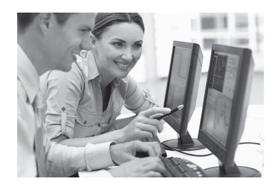
Working in teams increases efficiency.

Different factors affect the productivity of workers. Using new technology can make workers more productive as they can complete tasks more quickly using computers or machinery. Job satisfaction and work environment also influence productivity as happy motivated workers are more likely to work hard.