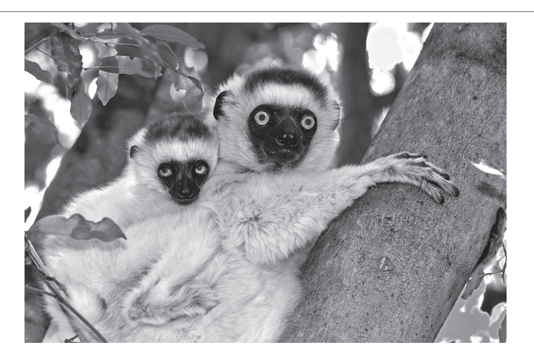
Fig. 4.1 for Question 4

Our tailor-made wildlife holidays put you close to the world's most exciting animals.