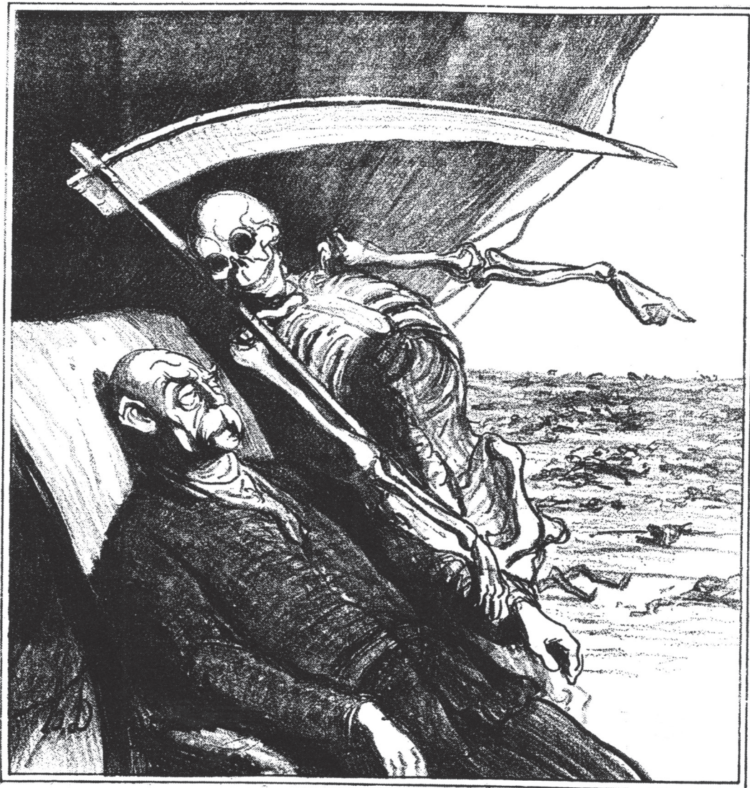
A French cartoon published in 1870 entitled 'The nightmare of Bismarck – Thank you!'