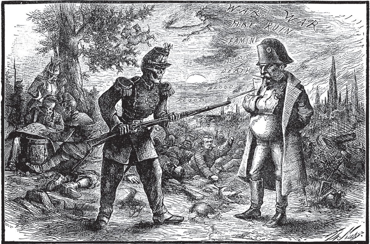
An American cartoon published in 1871. The caption read 'Who goes there?' – 'A friend'. The figure on the right is Napoleon III.